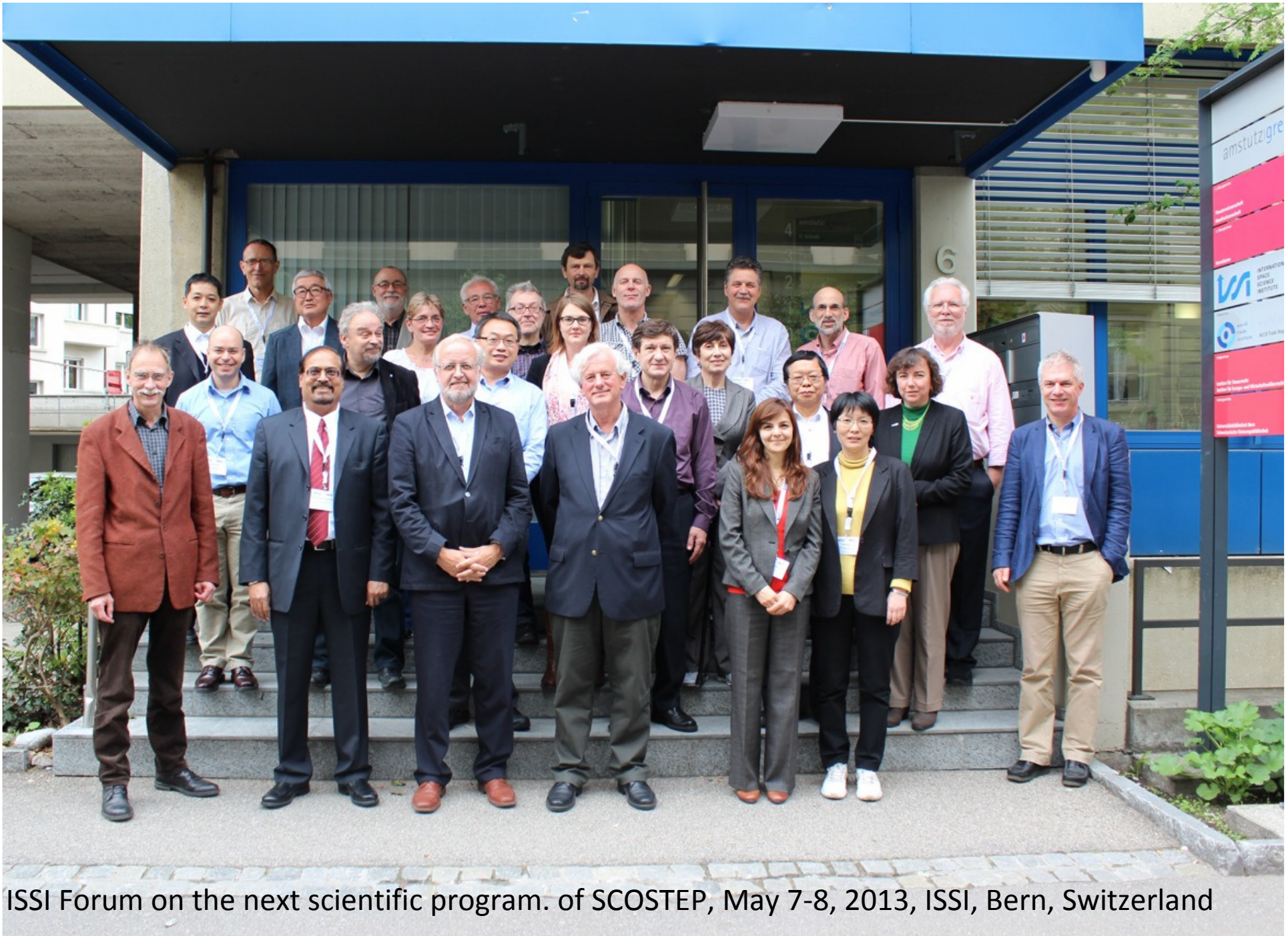
ISSI Forum on the next scientific program. of SCOSTEP, May 7-8, 2013, ISSI, Bern, Switzerland